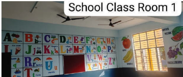
School Class Room 1