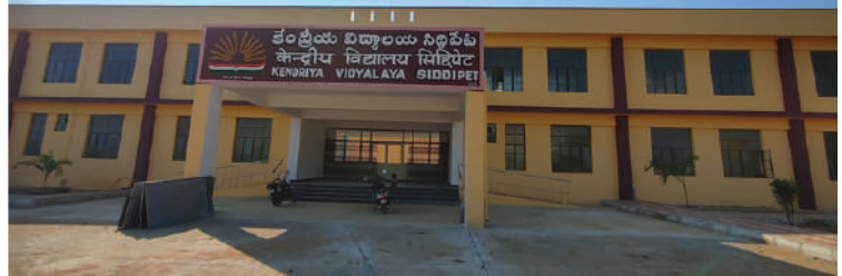
School Building - Side View