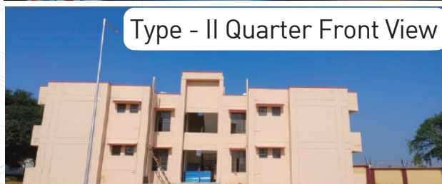
Type - II Quarter Front View