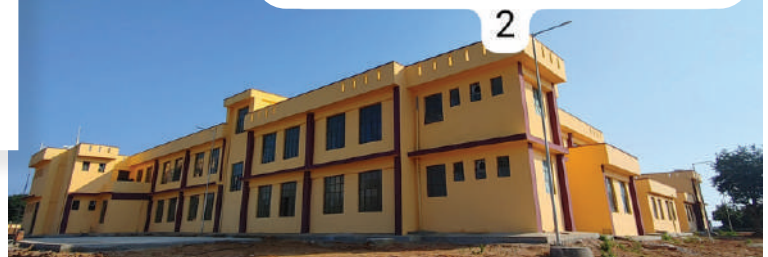
School Building - Side View