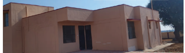
Type - V Quarter